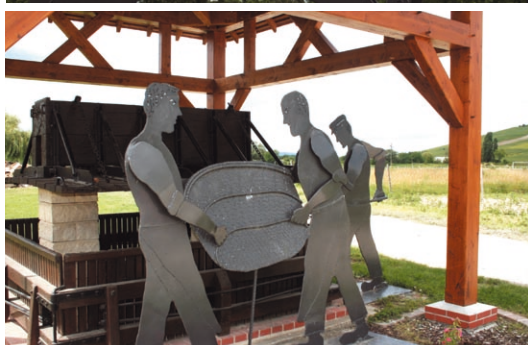
pressing the grapes

These sculptures were built with the support of