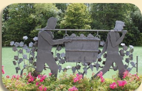
harvesting in the vineyard

Each group of sculptures is explained by an interpretive panel, with all the essential details of the champagne making process.